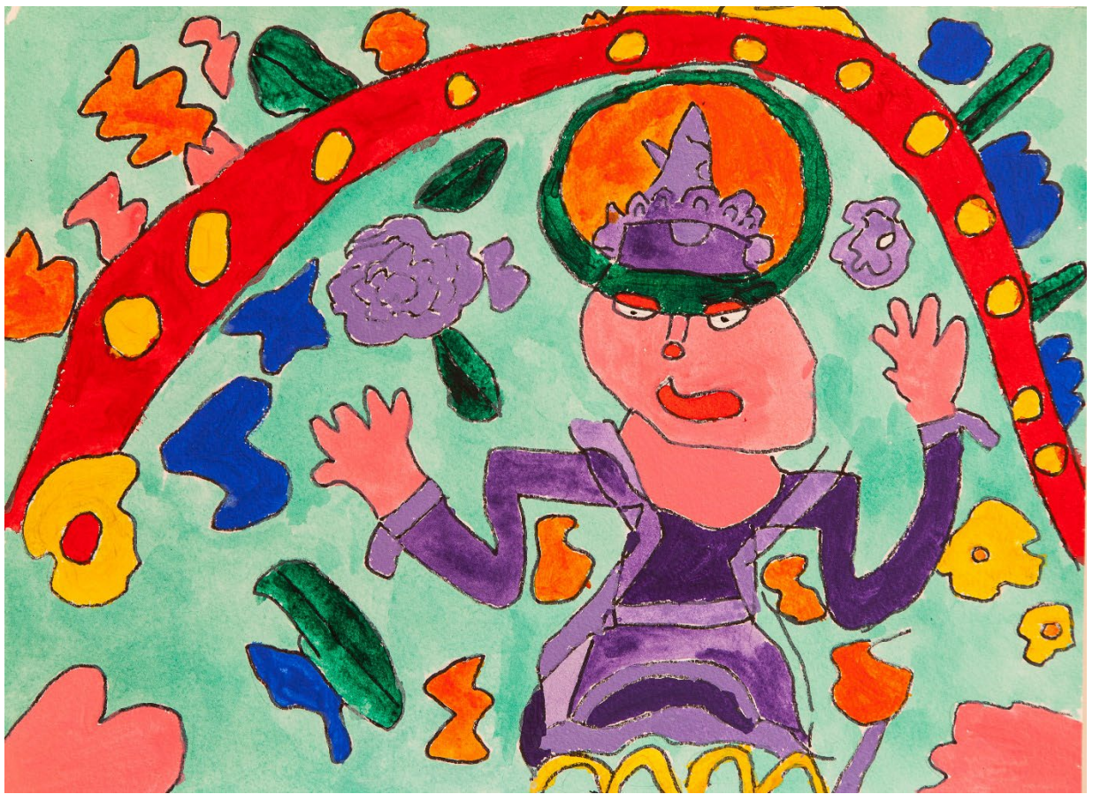
Stacey Fish Artist